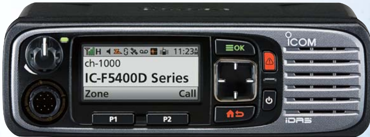
VHF DIGITAL TRANSCEIVER IC-F5400D