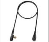
OPC-2362 Mobile to handheld cable