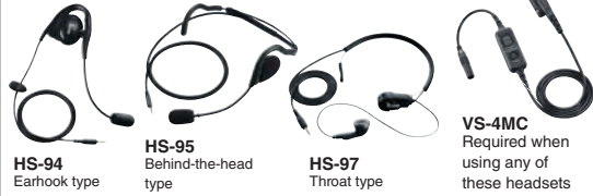
HS-94 Earhook type HS-95 Behind-the-head type HS-97 Throat type VS-4MC Required when using any of these headsets