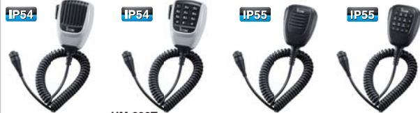
HM-220 Heavy duty microphone HM-220T Heavy duty microphone with DTMF keypad HM-221 HM-221T DTMF microphone