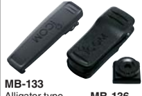
MB-133 Alligator type MB-136 Same as supplied. Swivel type