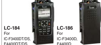
LC-184 For IC-F3400D/DS, F4400D/DS LC-186 For IC-F3400D, F4400D