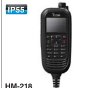
HM-218 Secondary remote control microphone for RMK-5. Options for IC-F5400D/F6400D only.