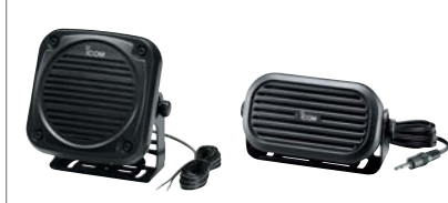
SP-30 20W rated input SP-35: 2m cable SP-35L: 6m cable