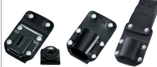
MB-96N MB-96F MB-96FL