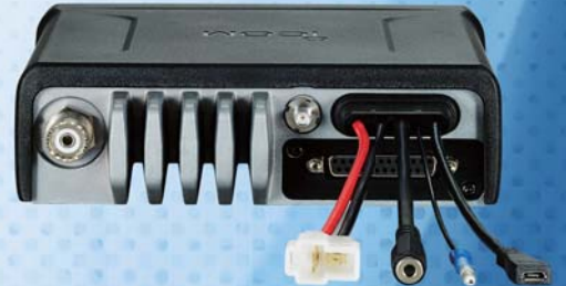
UHF DIGITAL TRANSCEIVER IC-F6400D