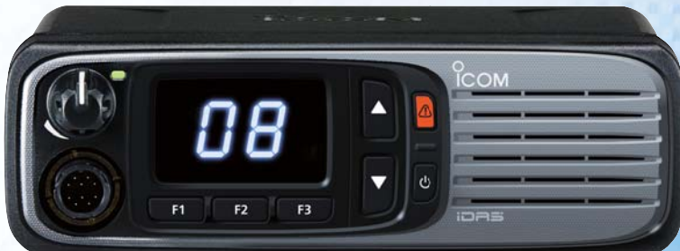
VHF DIGITAL TRANSCEIVER IC-F5400DS